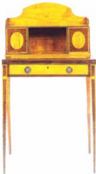
Bonheur –Du Jour Ladies writing table