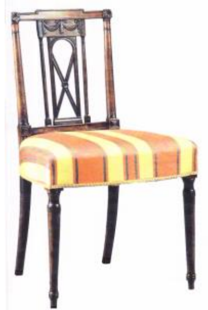
Lattice back chair