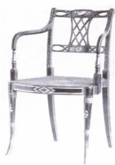
Lattice back chair