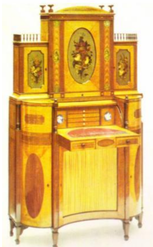
Ladies writing table