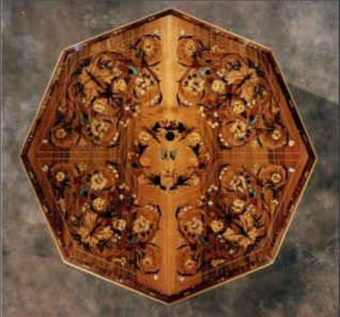
Marquetry Table from The American School of Marquetry